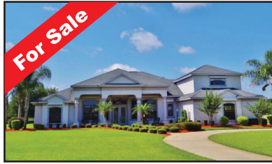
4 bedroom, 4 bath home in Port Orange, pool, spa, summer kitchen, 1 acre of land, asking $689,000