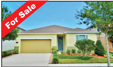
3 bedroom, 2 bath, lake front home in New Smyrna Beach, community pool & playground, asking $179,900