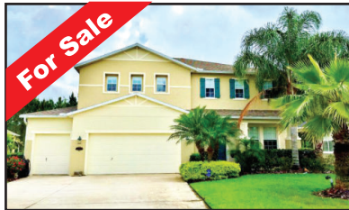
3 bedroom, 2.5 bath, 2 story home on cul-de-sac with many upgrades, asking $239,800