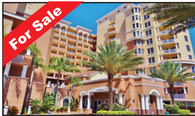
3 bedroom, 3 bathroom direct ocean front condo with impeccable views, gourmet kitchen, asking $614,900