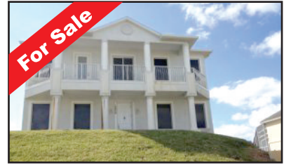
4 bedroom, 3 story ocean view home in Ponce Inlet, 4 car garage, asking $645,900