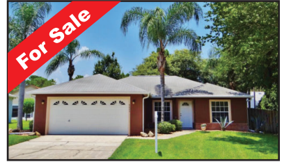
3 bedroom, 2 bath renovated home in Port Orange, fenced yard, large screened lanai, asking $194,900